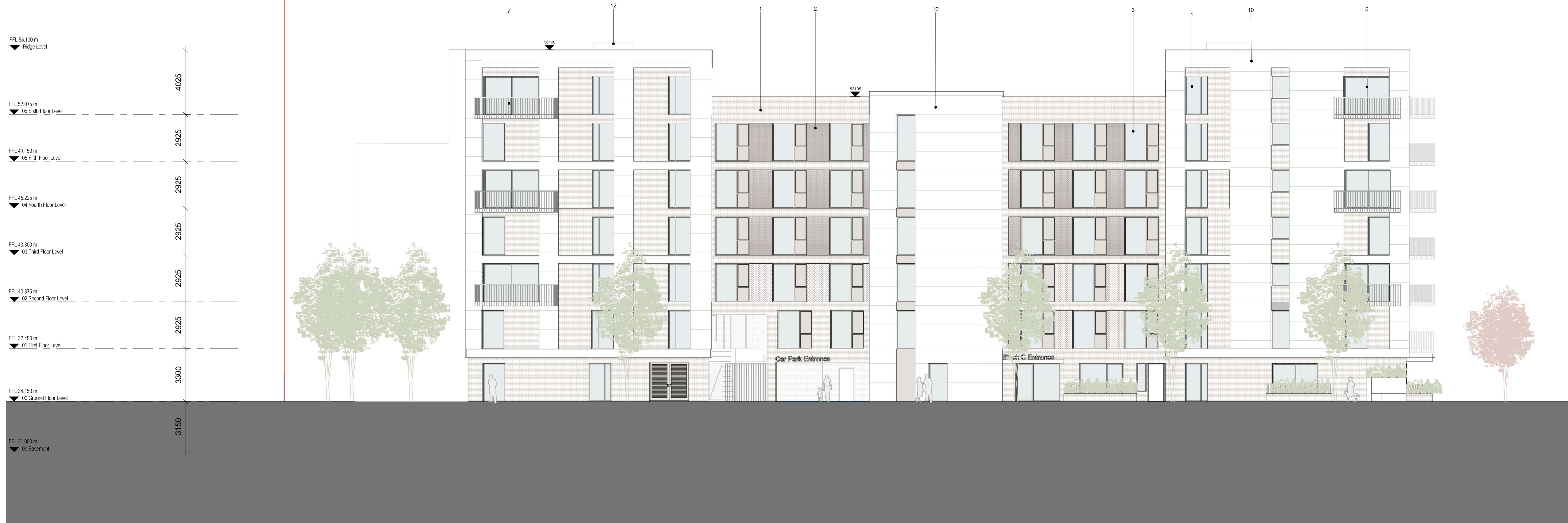
1 Elevation NE 1 : 100